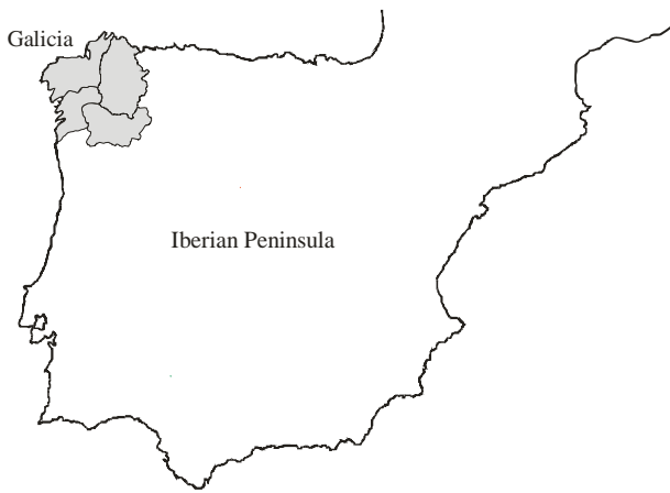
Map 1. Location of Galicia in the Iberian Peninsula

- Spain, Pontevedra, Pontearreas, Devesa, 29TNG4067, 60 m, in deciduous forest in riverbank, 10-IV-2007, J.L. Camaño . LOU-Arthr 7562.